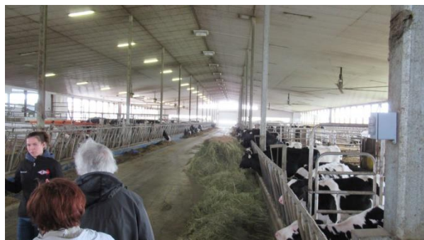
Feed pusher on a track for 85 cows in the barn at Werrcroft Farms.