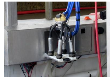
Auto-milkers - hand applied