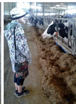
Nice coat. You too.