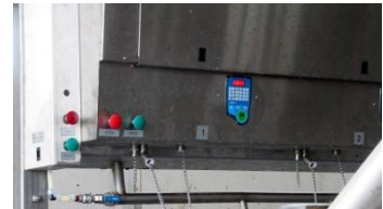
Auto-milker control panel