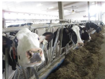
Happy dairy workers appreciative of Cassie's personal attention