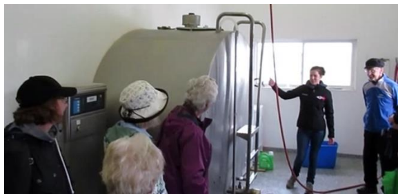
Milk quality testing room